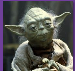
Teacher Quote of the Month - Mr. Yoda

“Love the children, I do. Teach the force, I must.”