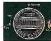
Size of nits and lice compared to a penny