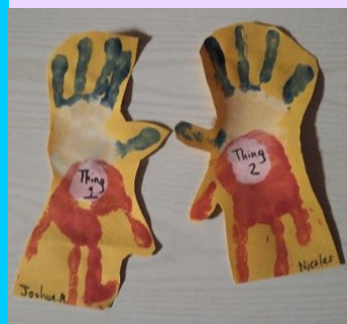
Thing 1 and Thing 2 Handprints

first and last names. So parents please pay close attention to your child's progress on letter writing. I will be informing you on upcoming projects in our class as well. Finally, parents please check cubbies for daily art work, news, and homework sheets. All homework is given out on Monday and should be returned on the expected due date and put in the purple basket, please.