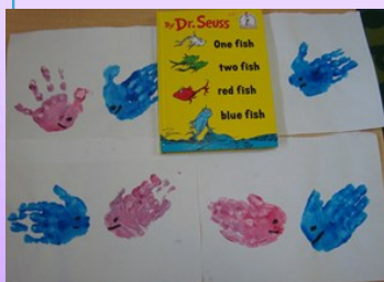
Dr. Seuss Project

Hi Dear Parents: In March, the students learned their colors by making the rainbows with various materials such as feathers, construction paper, and coloring. We had Dr. Seuss week and enjoyed different activities related to it. We also revisited our rainbow lesson when we celebrated St. Pat-