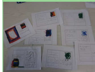
Mail for the Post office

value of loving one another so we painted our hearts red and pink. For the month of March we will continue to focus on recognizing our name and letters, shapes, colors, friendship, food groups and dinosaurs.