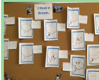
"I Have A Dream" Project

continue our lesson on sight words and math skills. Parents, I will be holding parent-teacher conferences at the beginning of March. If you have any questions or would like to meet with me just let me know and I will be happy to help. Thank You!