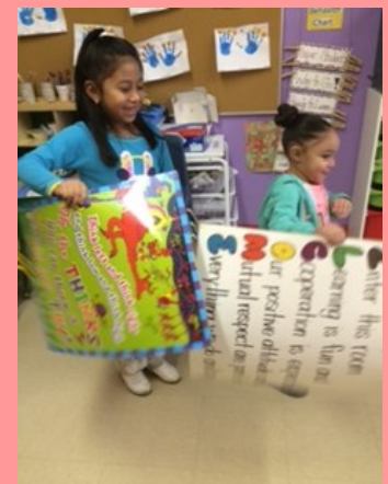
Creating Thunder Sounds

"Education is the most powerful weapon which you can use to change the world." - Nelson Mandela