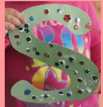
"S" is for Snake

and children that are of age and ready to move to the 4 year old classrooms will be doing so. Therefore, we ask that you help us in preparing your child for the 4 year old classrooms by having discussions with them and setting them at ease.