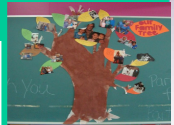
Class Family Tree

themes that we will work on will be insects, nursery rhymes, and some other exciting things. If there are any ideas or crafts that you would like to share with us feel free to talk to us. Until next month!