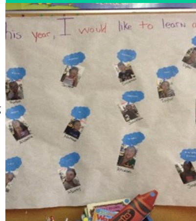
What we want to learn about poster