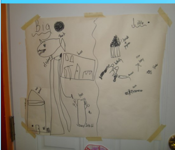
Opposites Big and Little

Happy 4th of July! To review the month of June, we began our opposites. We began with big/little, on/off and inside/outside. We also discussed summer and made our Father's day projects, which were a big hit. For the month of