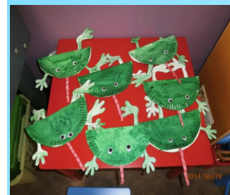
Paper Plate frogs

on a camping adventure in class. We will discuss the different things you bring on a camping trip and the different ways you use your 5 senses and the different type of bugs that they see outside. Please parents check cubbies everyday for homework package and the latest news, please and thank you. Ms. Barber