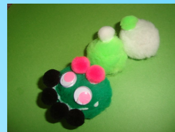
The children made insects using the art materials.

Parents are always welcome to stay and chat as long as they wish, read books to the children, bring books related to the themes or help with the kids'