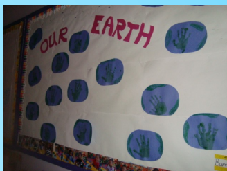
Our Earth Paintings

April showers brings May flower! Last month, we focus on Earth day, planting and Easter. We did many exciting activities which included; egg hunting and hand print earth. This month we will continue to focus on