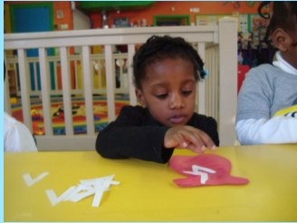
V's on our Vase

March is here and that means spring is around the corner! The children will have fun this month celebrating Dr. Seuss birthday and St. Patrick day. For the month of March, our letters will be letter S and letter M! The