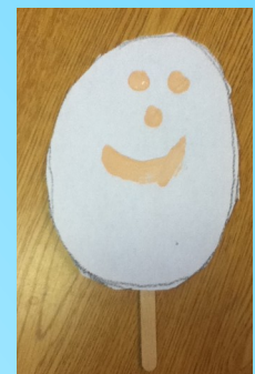
The children made "Me Puppets" and then created puppet shows.