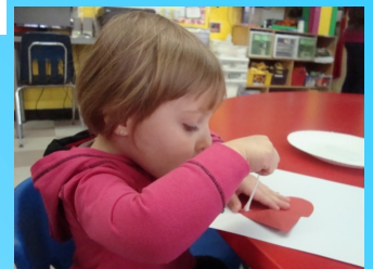
Piecing Together our Hearts

spring! Our activities may change; the learning is always continuing! Your child is always welcome to bring in their favorite book to share.