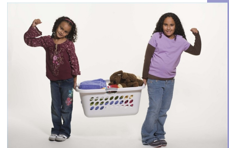
Children can be great helpers around the house.

http://www.webmd.com/parenting/features/chores-for-children