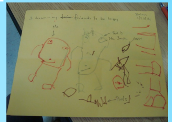
The children drew pictures of their dreams for the future.

If the weather permits, we will go out to play. Parents, please send your child with warm jacket, snow pants, gloves, hat and boots. Your child doesn't want to miss the snow fun.