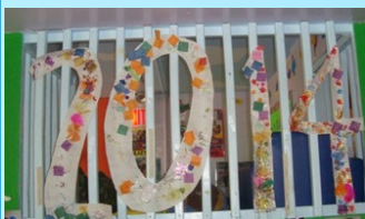
Our 2014 Banner

The month of January has already gone by, and we are ready for February. Last month, we celebrated the New Year with a healthy start by discussing topics like healthy living & nutrition, body parts, and friendship (in honor of Martin