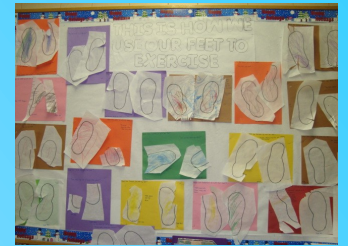
Our Exercising Feet

If you have any questions feel free to ask.