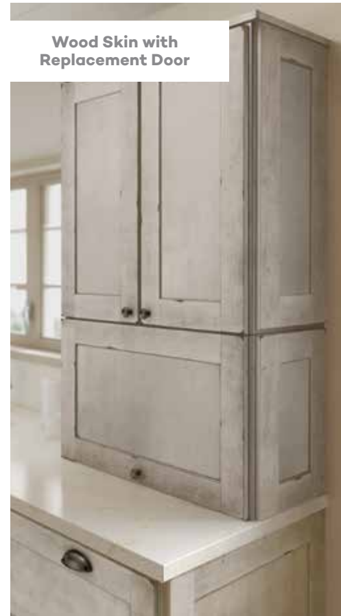
Wood Skin with Replacement Door

The same look can be achieved by selecting All-Plywood Furniture Construction (APFC) or Furniture Plywood End (FPEB) as an option on the cabinet.