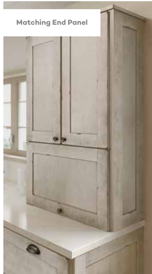
Matching End Panel

Simple and easy. Matches your door style and covers the whole side including the edge of the face frame. No skin needed.