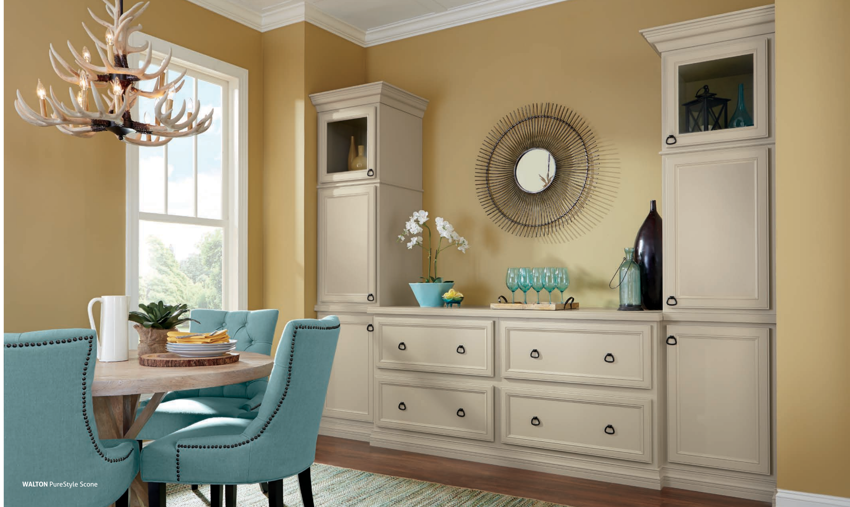
WALTON PureStyle Scone