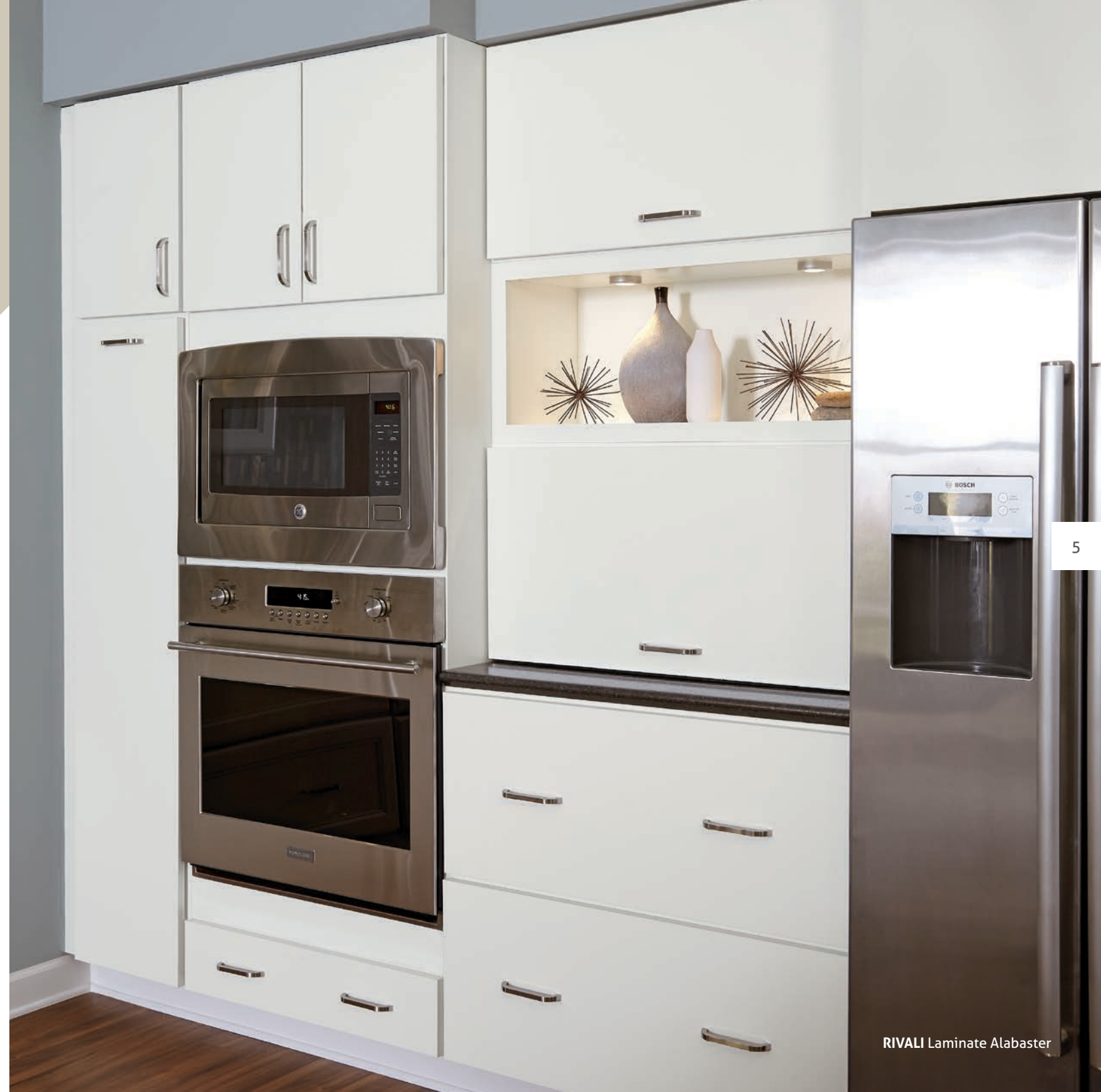
RIVALI Laminate Alabaster

Available finishes: Alabaster, Bluff, Brie, Limestone and Scone