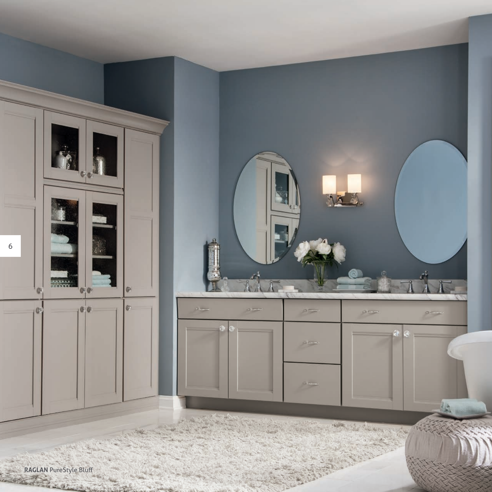
RAGLAN PureStyle Bluff