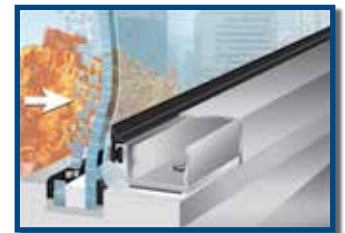
Madico FrameGard movement zone absorbs energy by allowing window film to stretch. Radiused edge prevents cutting of film. Gripped surface clamps film in place.