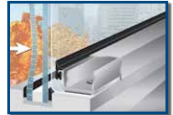
Blast impact shatters external glass and drives it against the inner pane.