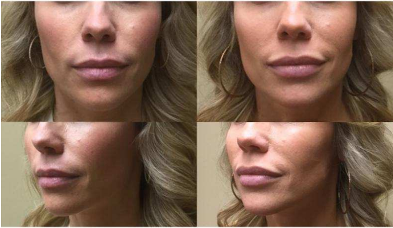
10 Days After Volbella in Lips

the process and answer questions. She is a talented aesthetician; warm, friendly, and knowledgeable. The clinic is beautiful, and every staff member I met was very friendly. The treatment was a great value for the price, I will be back soon! "