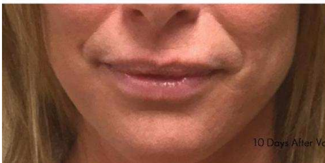
10 Days After Volbella in Lips