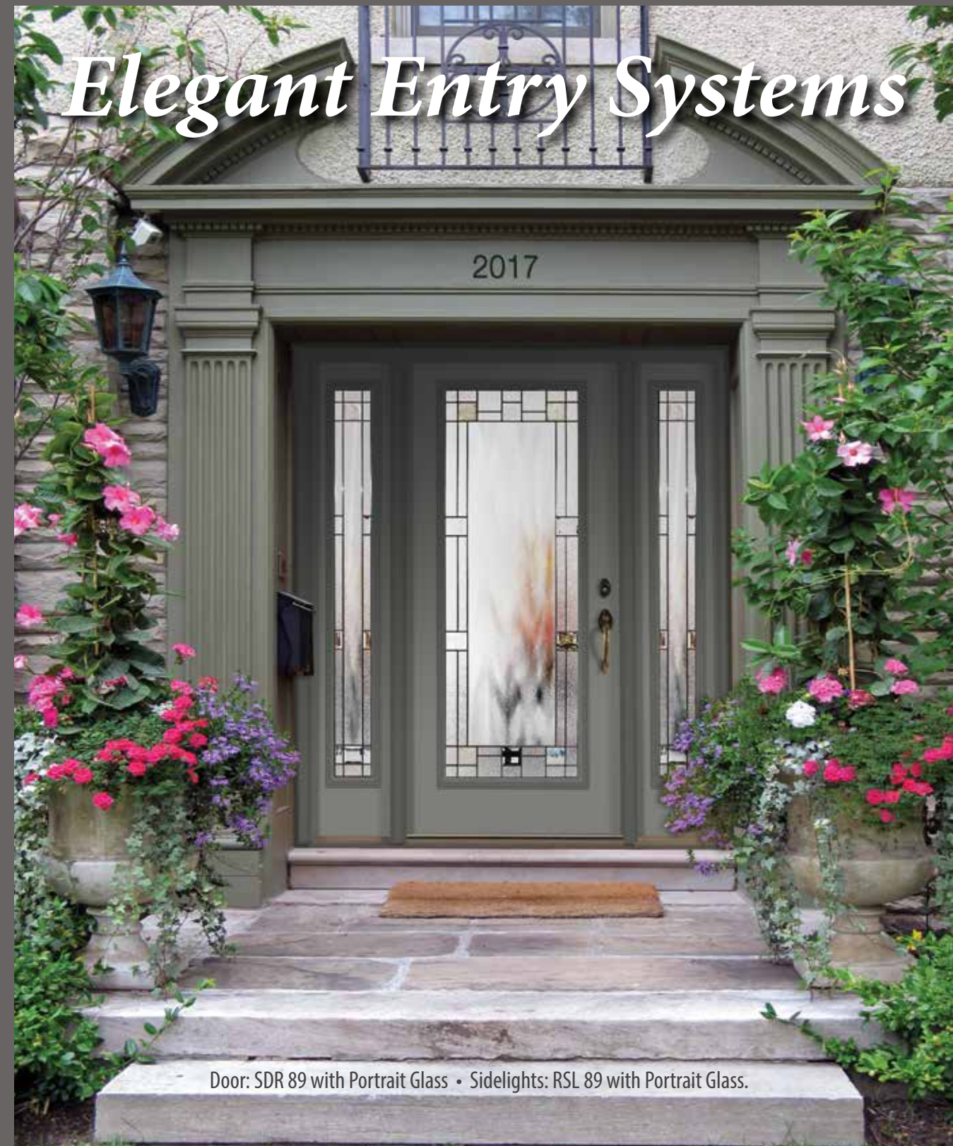
Door: SDR 89 with Portrait Glass • Sidelights: RSL 89 with Portrait Glass.

STEEL DOORS www.targetwindowsanddoors.com