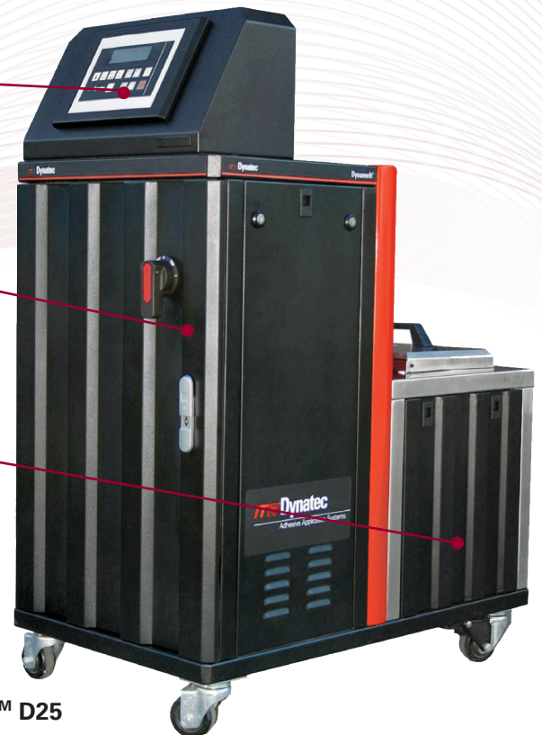
ITW Dynatec - Dynamelt™ D25

Melt-On-Demand hopper extends adhesive life and performance.