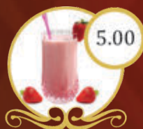
227. Sinh Tố Dâu Strawberry Milk Shake