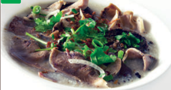
CHÁO LÒNG DỒI