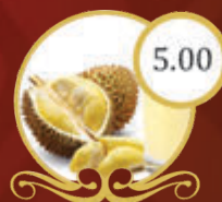
221. Sinh Tố Sầu Riêng Durian Milk Shake