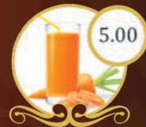
224. Sinh Tố Cà Rốt Carrot Milk Shake