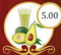
222. Sinh Tố Bơ Avocado Milk Shake