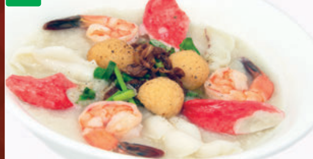
CHÁO ĐỒ BIỂN