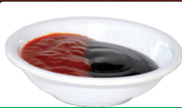
TƯƠNG & ỚT