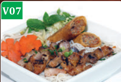
BÚN GÀ NƯỚNG, CHẢ GIÒ