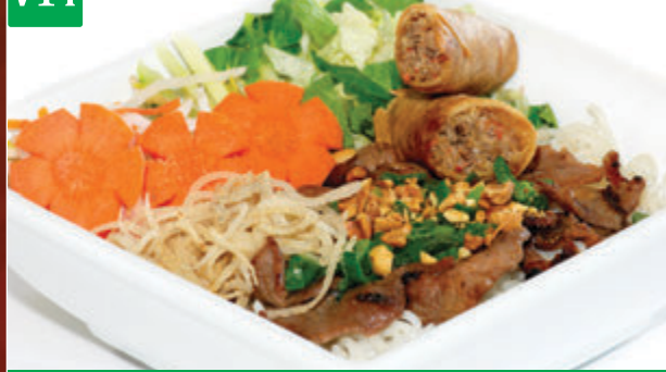
BÚN THỊT NƯỚNG, CHẢ GIÒ, BÌ

GRILLED PORK, SPRING ROLL, SHREDDED PORK SKIN