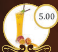
232. Nước Chanh Dây Passion Fruit Juice