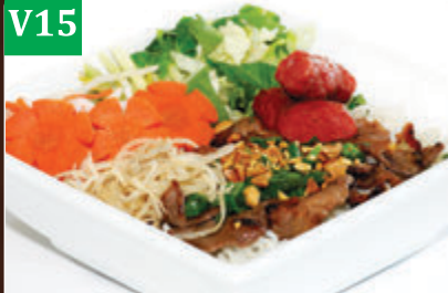
BÚN THỊT NƯỚNG, NEM NƯỚNG, BÌ

GRILLED PORK, GRILLED PORK STICK, SHREDDED PORKSKIN