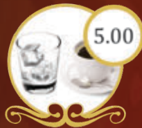
202. Cà Phê Đá Iced Filter Coffee WITHOUT Milk