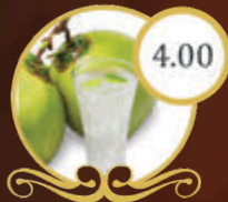
208. Nước Dừa Tươi Fresh Coconut Juice