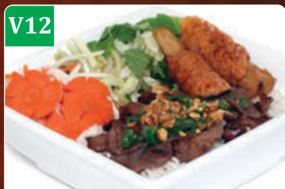
BÚN THỊT NƯỚNG, CHẠO TÔM