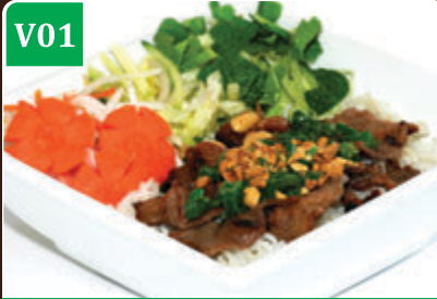
BÚN THỊT NƯỚNG