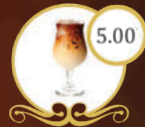
233. Cà Phê Thái Thai Iced Coffee