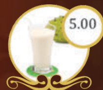
218. Sinh Tố Mãng Cầu Sour Sop Milk Shake