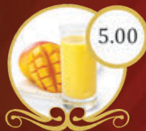
220. Sinh Tố Xoài Mango Milk Shake