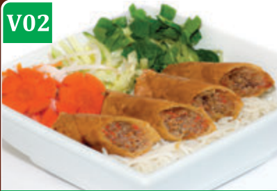
BÚN CHẢ GIÒ