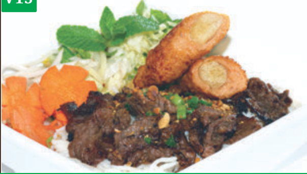
BÚN BÒ NƯỚNG, CHÁO TÔM