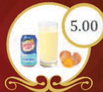
214. Soda Sữa Hột Gà Soda with Condensed Milk and Egg