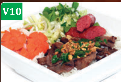
BÚN THỊT NƯỚNG, NEM NƯỚNG