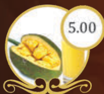
219. Sinh Tố Mít Jackfruit Milk Shake