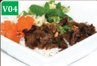
BÚN BÒ NƯỚNG