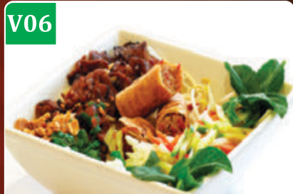
BÚN THỊT NƯỚNG, CHẢ GIÒ