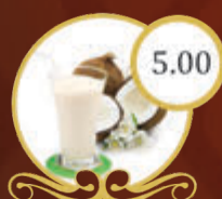
223. Sinh Tố Dừa Coconut Milk Shake