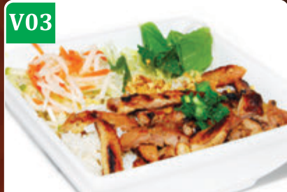
BÚN GÀ NƯỚNG