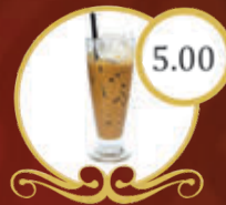
203. Cà Phê Sữa Đá Iced Filter Coffee WITH Condensed Milk