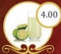
209. Nước Chanh Tươi Fresh Lemon Juice