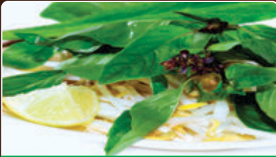
CHANH, RAU, GIÁ, NGÒGAI

Phở noodle soup will be served with choice of meat accompanied with a side dish of: BEANSPOUT, LIME, BASIL, CILANTRO, CORIANDER, HOISIN SAUCE and CHILLI SAUCE