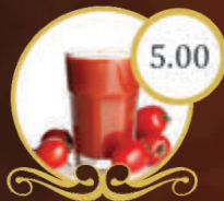
225. Sinh Tố Cà Chua Tomato Milk Shake