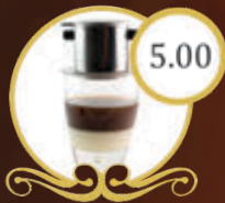
201. Cà Phê Sữa Nóng Hot Filter Coffee with Condensed Milk