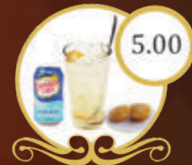
216. Soda Chanh Muối Soda with Salted Lime