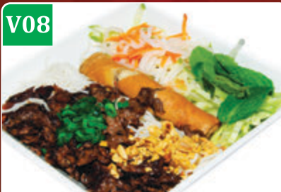
BÚN BÒ NƯỚNG, CHẢ GIÒ