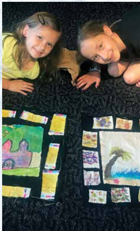
Students share their artwork from the "Story Quilts" youth art class in June.