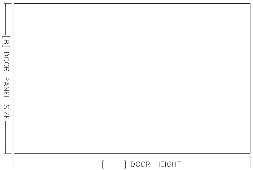
ELEVATION VIEW HALL SIDE