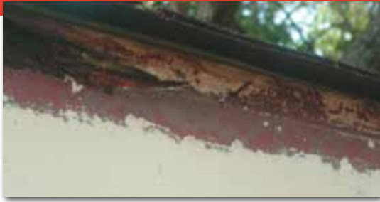
ROT & MOLD