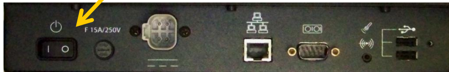
I/O Panel view—see back page for a detailed view