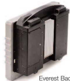
Everest Back View