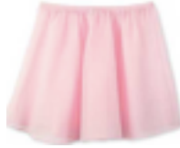
Pink Ballet skirt (no tutus for primary dancers)