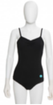
Cami or Tank Leo