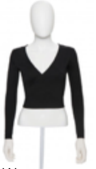
Wrap sweater or any tight fitting sweater