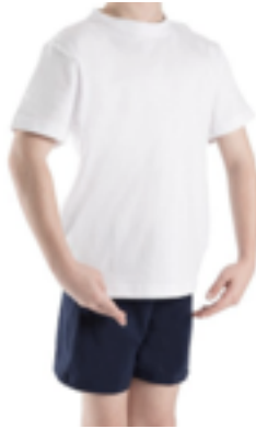
White fitted Tee