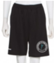
Black shorts or black leggings