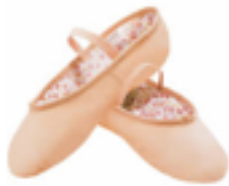
Leather/canvas ballet slippers in white or black