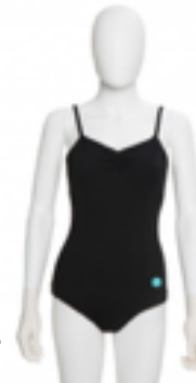
Cami or Tank Leo