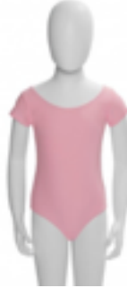
Cap Sleeve Leo