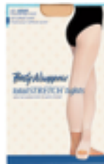
Pink convertible tights ONLY!