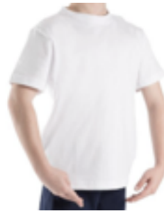
Fitted White/ Black Tee