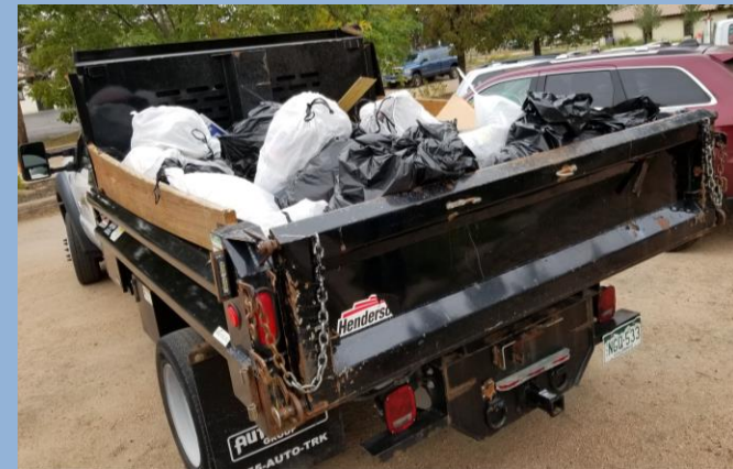
Town of Monument