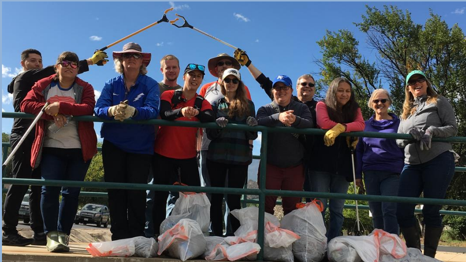
Pikes Peak Area Council of Governments