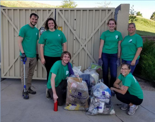
Integrity Bank and Trust