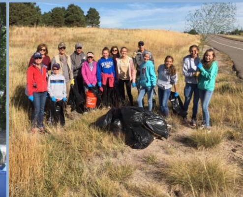
USAFA Natural Resources