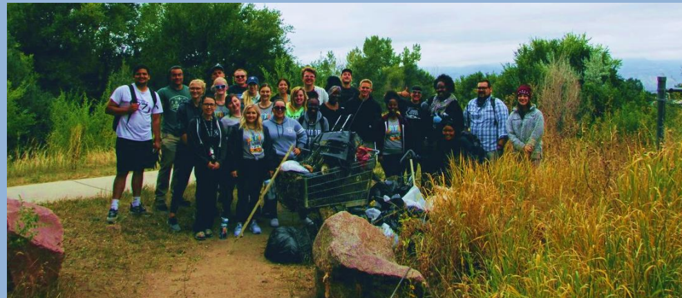
University of Colorado – Colorado Springs