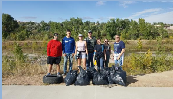
Matrix Design Group