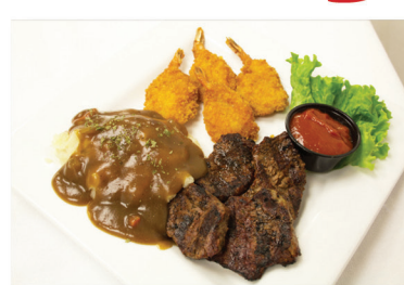
Breaded Shrimp & Steak Medallions