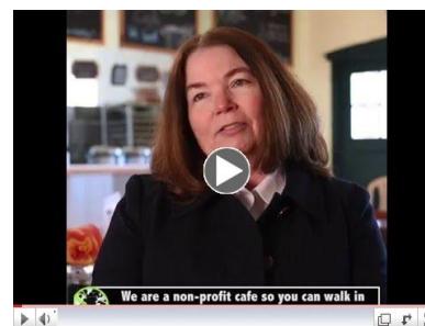
About FoCo Cafe created by The Sanguine Report

Coloradoan: FoCo Cafe thriving as nonprofit restaurant Blog: 20 Things to Do in Fort Collins and Loveland Under $20 CSU Life magazine (page 17): Thankful for FoCo Cafe Sanguine Report Video: FoCo Cafe - About Sanguine Report Video: FoCo Cafe - Food Sanguine Report Video: FoCo Cafe - Community Sanguine Report Video: FoCo Cafe - Volunteering Movement Project Mini-Documentary: FoCo Cafe