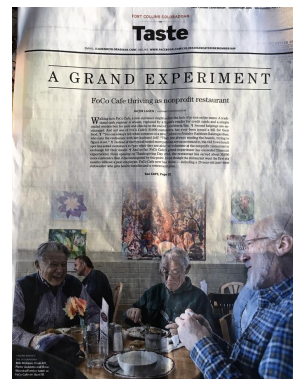
Coloradoan: FoCo Cafe thriving as nonprofit restaurant