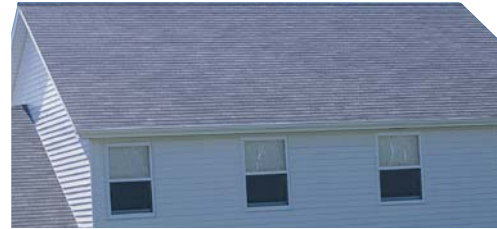
WITH QUARRIX VENTILATION