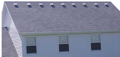
WITHOUT QUARRIX VENTILATION

Using traditional “pot” or turbine vents results in uneven ventilation and creates hotspots on your roof.