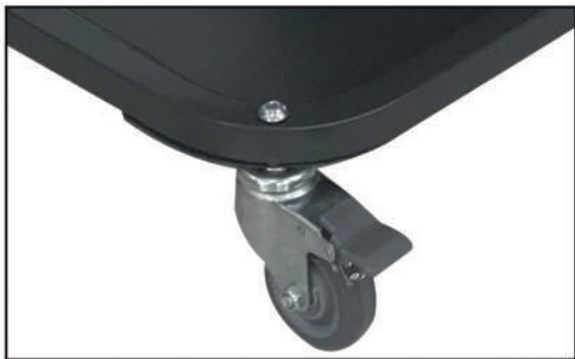
✓ 6" lockable front caster