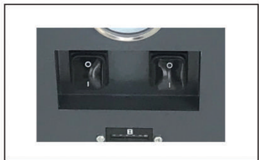
✓ Embedded ON/OFF switch buttons, anti-collision. Individual switches control the 2 motors separately