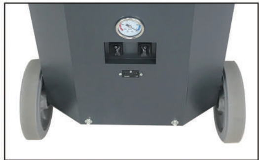
✓ 8" heavy duty non marking rear wheel