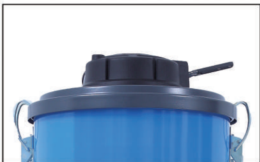
✓ Classic and effective jet pulse filter cleaning