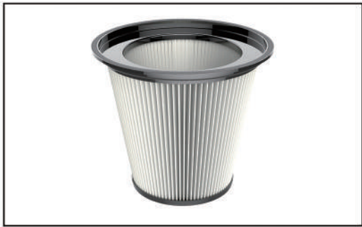
✓ First stage 1 pc F8 conical filter with 28ft 2 filter area