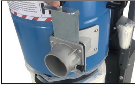
✓ 2.75 inch Aluminum die-casting inlet