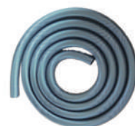
2" double layer EVA hose X25ft