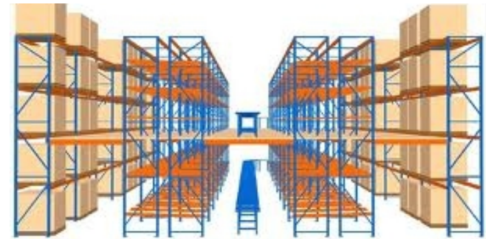
Multi-Level Pick Module for Slow-Pick Consolidation