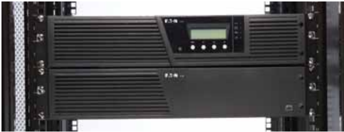
Add up to four EBMs for hours of runtime