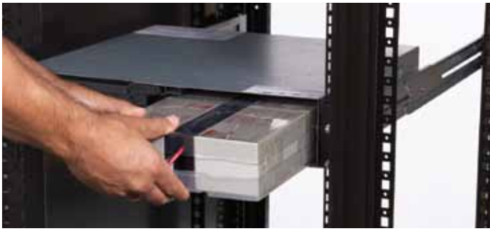
Hot-swappable internal batteries in only 2U