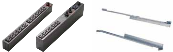
Optional FlexPDU and HotSwap MBP for greater flexibility and uptime

To learn more, please visit: Eaton.com/intelligentpower