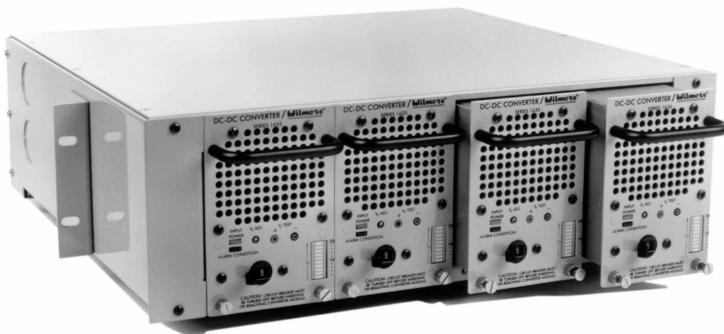
Model 1635-48-24-20 Converter Modules and Model 1635-48-24-S19 Power Shelf