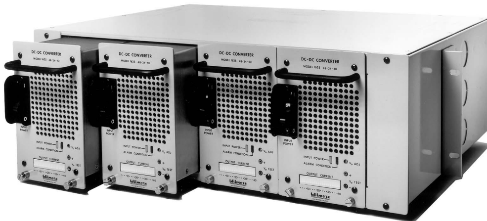
Model 1625-48-24-40 Converter Modules and Model 1625-48-24-SH Power Shelf