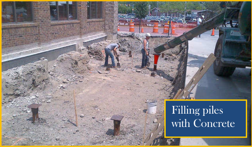
Filling piles with Concrete