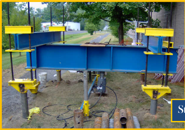
Static Load Testing