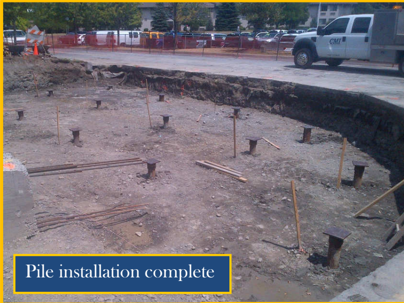
Pile installation complete

6348 Furnace Rd. Ontario, NY 14519 (315)524-4780