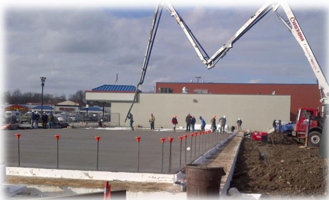
Install Structural Floor Slab System....and pour concrete