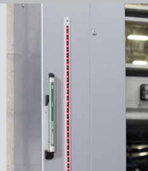
Pathwatch warning lights and brake release lever