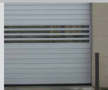
Solid and vision slats shown