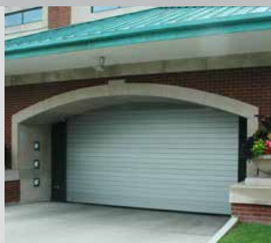
Sleek six inch high slats shown