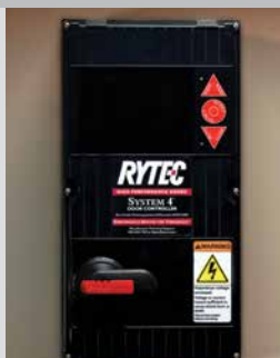
System 4 shown with optional rotary disconnect

Standard maximum sizes shown; larger sizes may be available upon request.