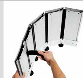
Integral rubber weatherseal