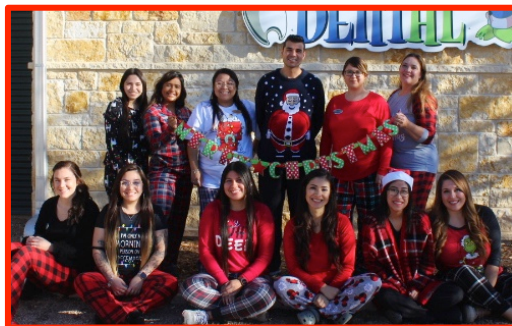
San Marcos Office