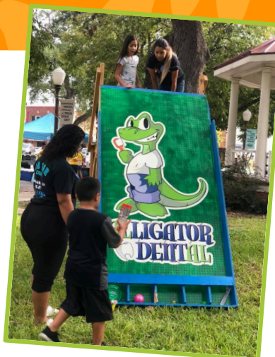
Kids Day in the Park in Seguin

October was FULL of fun events for the Gator Crew!