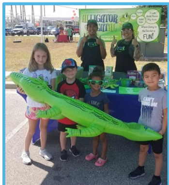
CTMC Family Fit Fun Day in San Marcos

October was FULL of fun events for the Gator Crew!