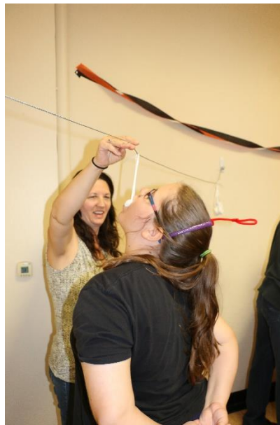
Bobbing for doughnuts