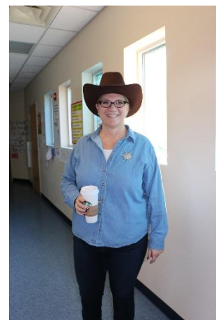
Great costumes and great fun!