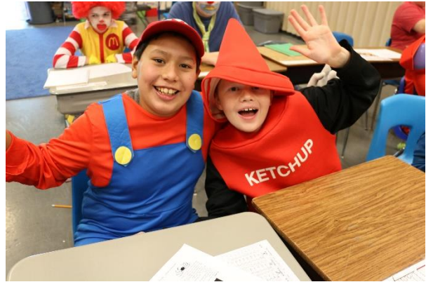
Ready to party!